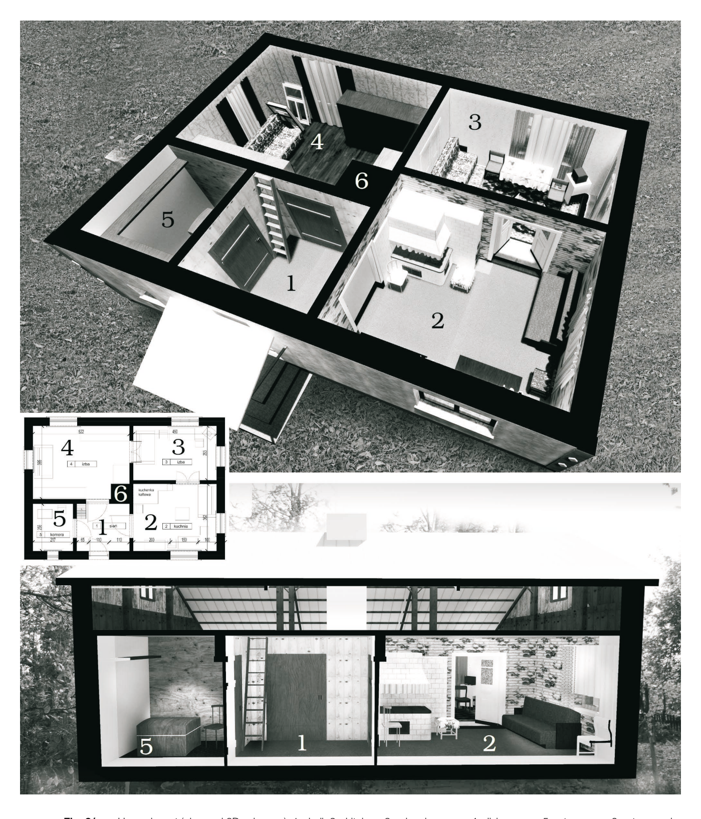
Fig. 8/a-c. House layout (plan and 3D schemes): 1 - hall, 2 - kitchen, 3 - sleeping room, 4 - living room, 5 - storeroom, 6 - stove and chimney; source: the authors, 2022