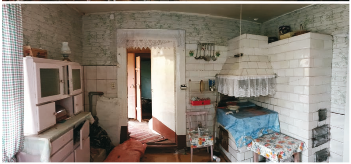
Fig. 7/a-c. Panoramic views of the living room (a) and the kitchen (b, c); source: the authors, 2021