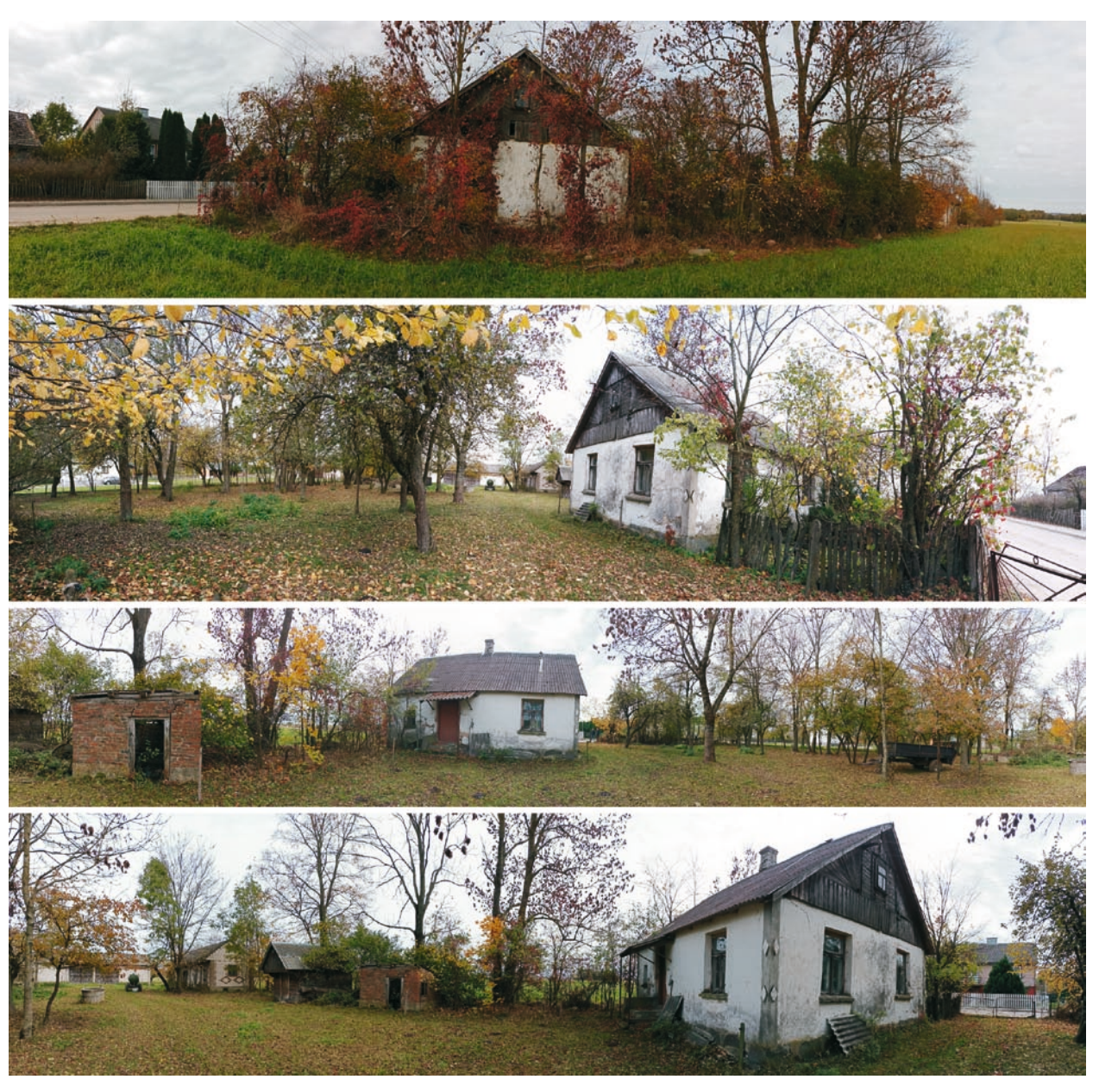
Fig. 3/a-d. The cordwood house in Olszewo, against its farmstead plot (panoramic views); source: the authors, 2021

coarser unbarked juniper brushwood and waste wood were used as 'reinforcement' for the clay wall (Fig. 5). Cut boards, perhaps remnants of wood salvaged from previously burnt buildings, were used to reinforce the corners. These have survived in fairly good condition.