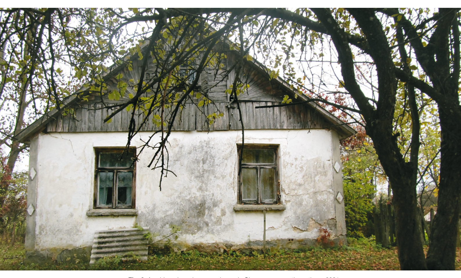
\textbf{Fig. 2.} \ \, \textbf{An old cordwood masonry house in Olszewo}