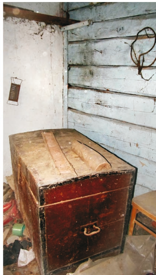
Fig. 13. A storage room with an old trunk and some old utensils

The storeroom, in turn, was secondarily separated from the hall by a wooden wall (not a clay wall; Fig. 13) and was also used for storage purposes, in which to this day – in fact, until the survey in December 2021 – are preserved, among other things, a trunk, a wooden mould for making valonki , a weaving warp hook and old-type shears for shearing sheep, and an old charcoal iron.