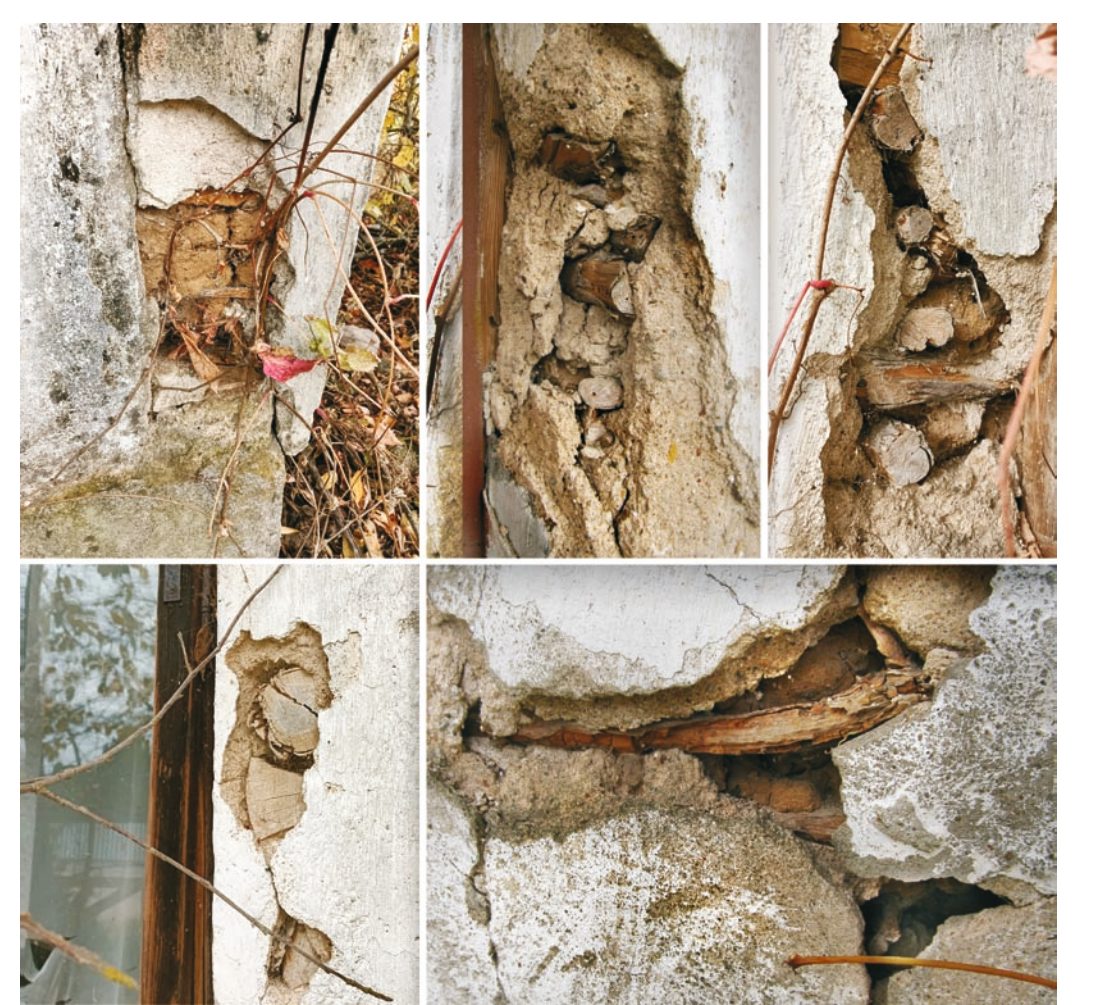
Fig. 5/a-e. Walls of the house in Olszewo: exposed clay core and stovewood pieces, embedded in thick lime mortar; source: the authors, 2021