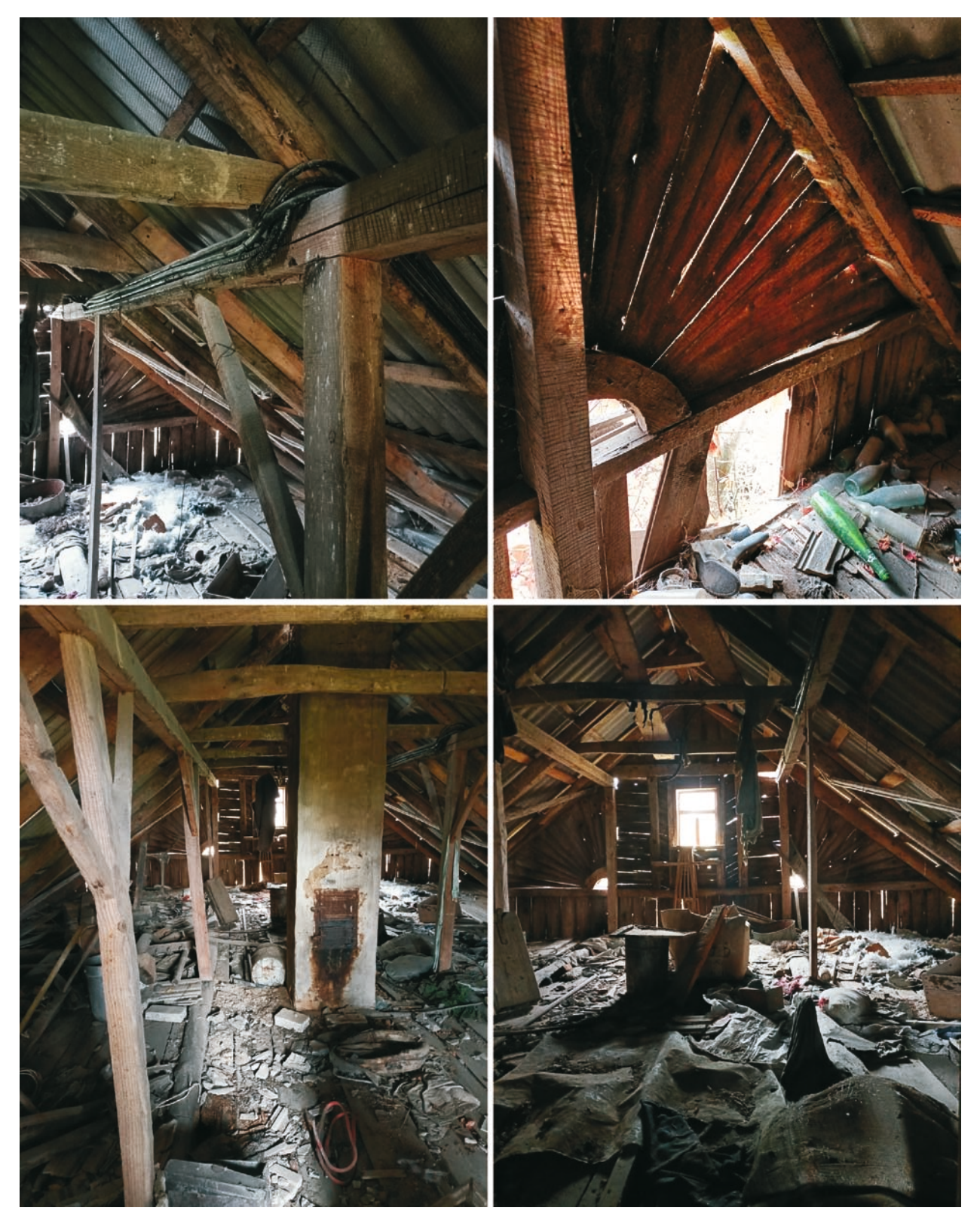
Fig. 6/a-d. A garret and roof construction

most queen posts and two central posts with braces (Fig. 6). This construction is noteworthy insofar as it was usually used in small-town and urban construc-