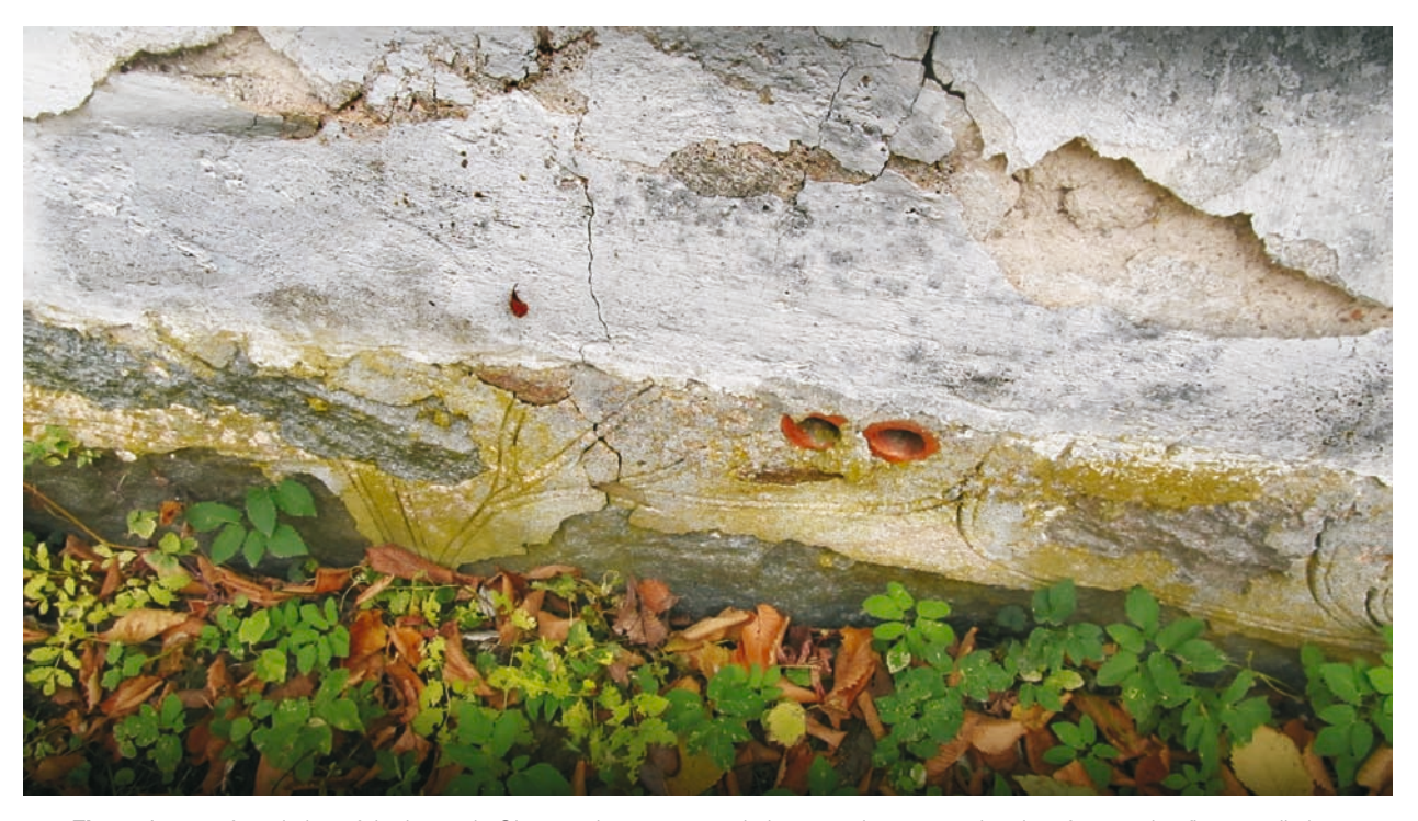
Fig. 4. A stone foundation of the house in Olszewo, its ornamented plaster and two ceramic tubes for wooden floor ventilation; source: the authors, 2021