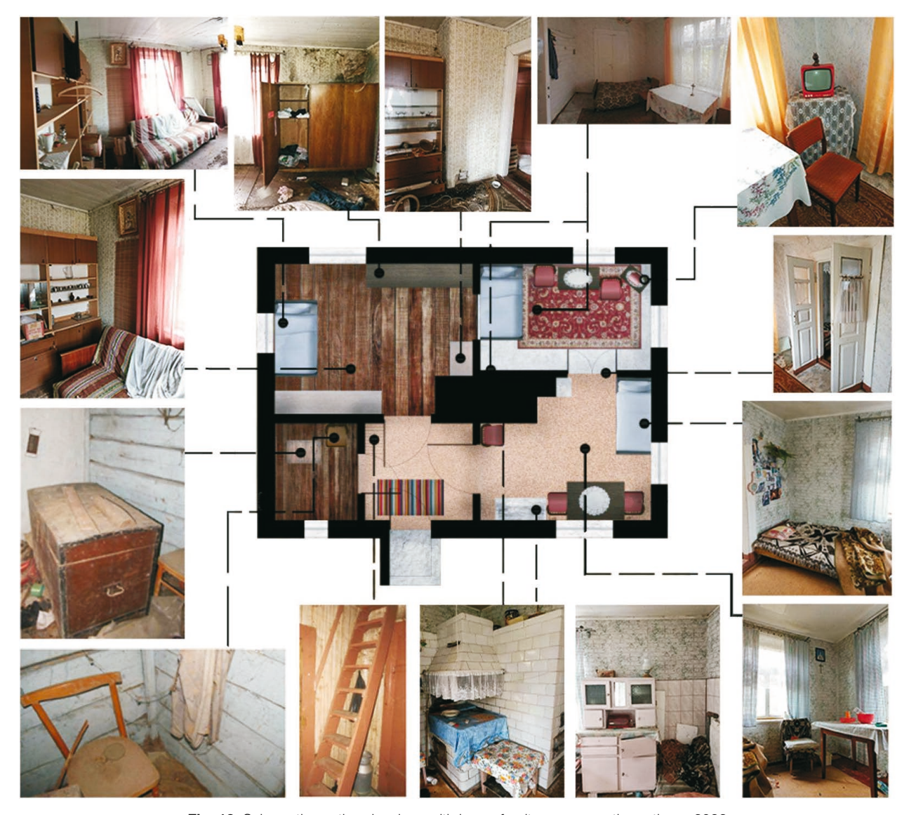
Fig. 10. Schematic section drawings with home furniture; source: the authors, 2022