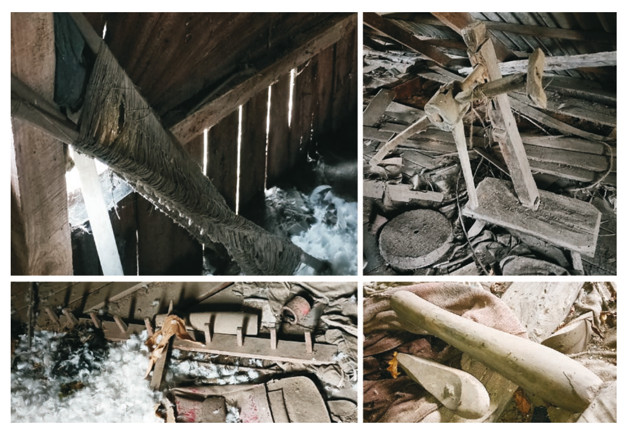
Fig. 12. Old artifacts of vernacular craft, left in the garret space; source: the authors, 2021