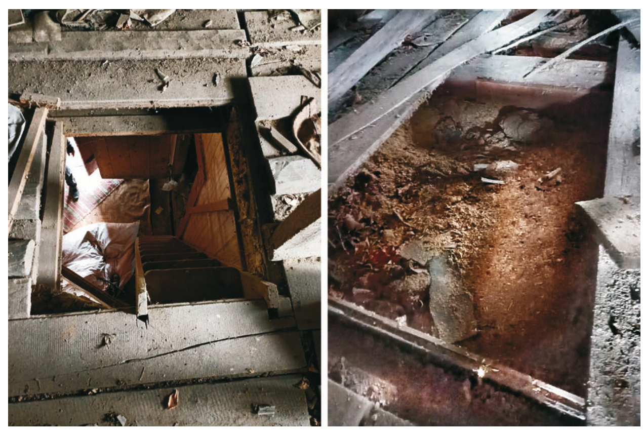
Fig. 11. Garret floor construction (a – ladder descending to the entrance hall; b – earthen insulation)