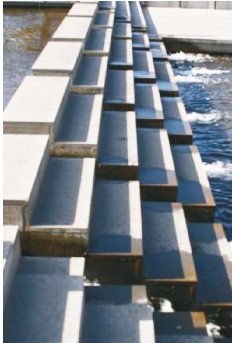
Fig. 1. Międzywodzie on the Młyńska Island

The world of urban space is sometimes referred to as a book that can be read in a variety of ways, taking into account the inner richness of the subject of cognition. A representative of the Tartus-Moscow school, Vladimir Toporov explored the spatial structures and areas of memory he found in the historical quarters of St Petersburg. The Russian semiotician saw that the symbols and meanings contained in the urban space perform an integrating function for the local community and at the same time crystallise the urban layout. The city is an accumulator of collective memory, in which the process of translation of the object into the natural language of subjective discourse takes place. The content of meanings and codes should be subject to