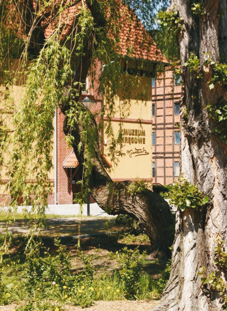
Fig. 4. On Młyńska Island, L. Wyczółkowski Museum