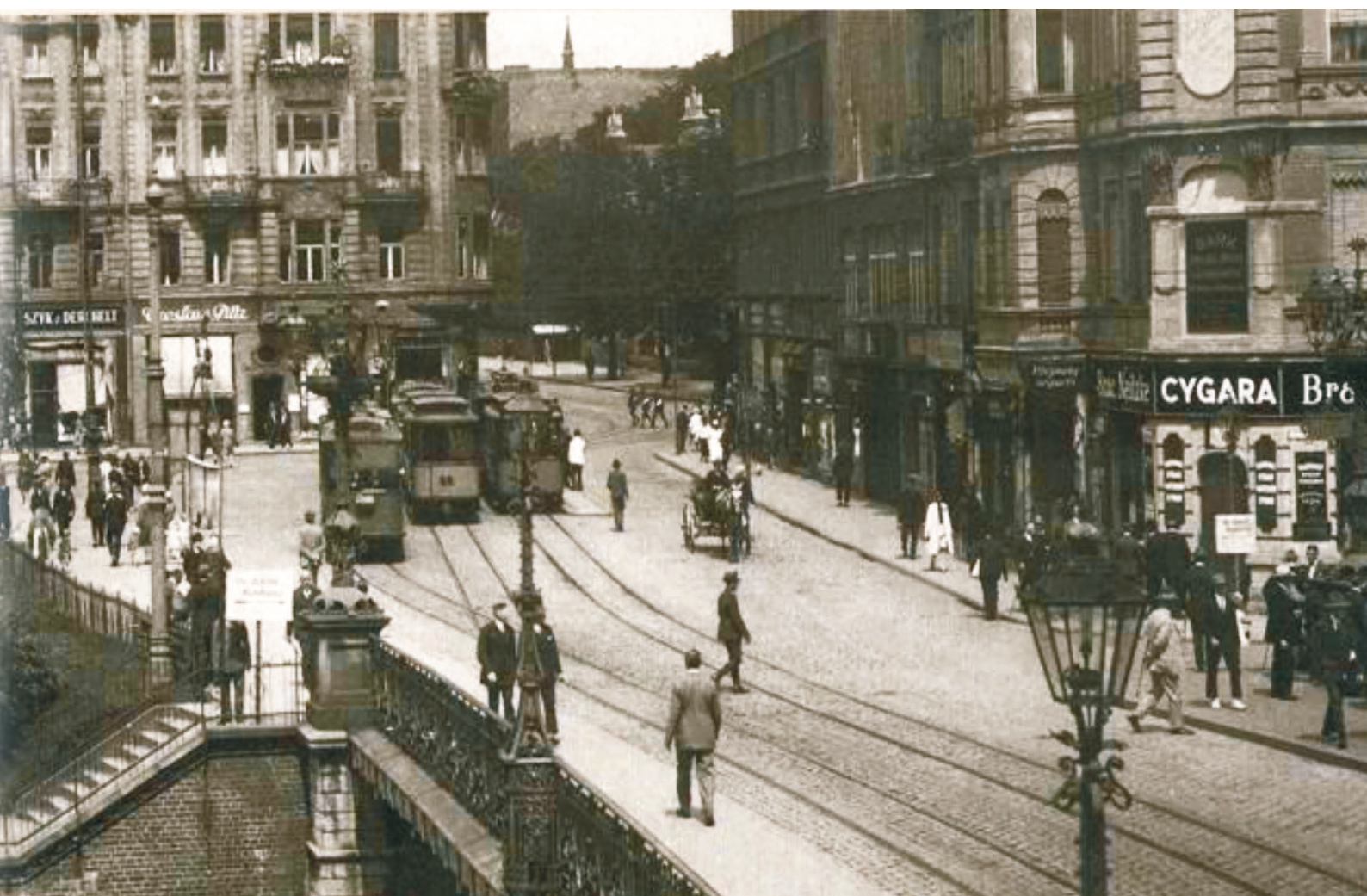
Fig. 10. Mostowa St.; source: [Z. Hojka 2008]

From the picture of Bydgoszcz sketched above, one can clearly deduce the reality that can be understood by the subject in its natural language. One can live with the conviction that “in language there are preserved human experiences transmitted from generation to generation, containing something extremely valuable, and even that language itself, this condition of culture, and perhaps of thinking, points to what is essential, what flows from the very source” [B. Skarga 2005]. According to U. Eco “culture is signifying and communicating” [U. Eco 2009]. Images are subject to naming, subject to analysis, which is a verbal message. In the specifics of the reading of the content of words contained in space discussed here, it should be said that we are dealing with an immanent process. After all, language is a monologue. The subject, wishing to discover the truth of a given reality/space, enters with it on the plane of play, the specifics of which L. Wittgenstein wrote about in his Philosophical Investigations . Aristotle stated that a game can