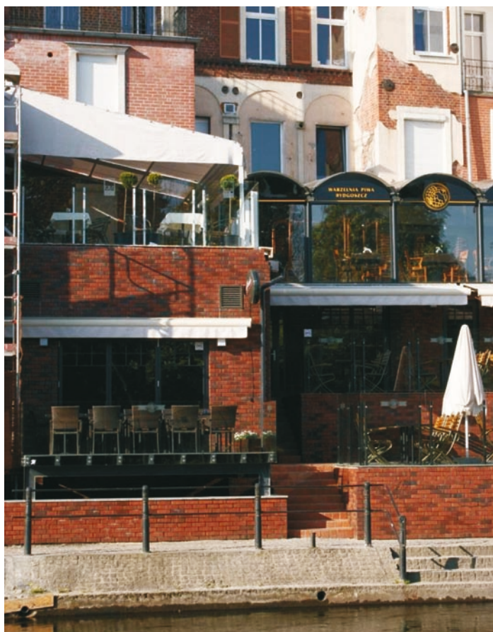
Fig. 3. On the Brda Młynówka river

How different, full of admiration, are his opinions on Art Nouveau, where one can find, according to F. Weidner, the engaging functionality of Art Nouveau furniture, the experimental beauty of new types of glass in Tiffany's works, or the architectural harmony of the artists' estate in Darmstadt.