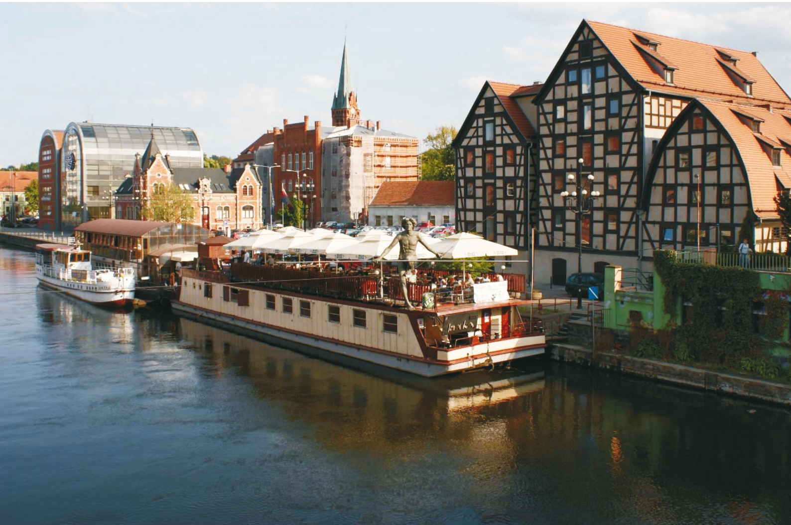
Fig. 14. BRE Bank, Loyd's Palace and granaries on the Brda River

A mark in the city's silhouette are the BRE Bank "granaries" by architects Andrzej Bulanda and Włodzimirz Mucha. They were built just down the street from the original merchant ones, where grain was stored before its onward journey to Gdansk. In this case, the architecture communicates its clear message through spatial forms. The technical detailing of the contemporary twin shapes is highlighted by the immediate vicinity of the fine neo-Renaissance Loyd Palace. One should not speak of stylistic contrast in this situation. Just as the towers of the Trinia dei Monti church are drawn against the blue of the southern sky, so here, the cool surface of the bank is the backdrop for the palazzo, sculpted and harmonious in its proportions.