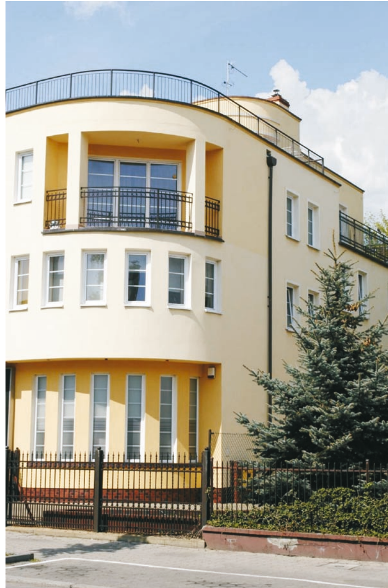
Fig. 2. Villa in Sielanka; source: photo by the author

This bygone world can easily be seen at the junction of Mostowa and Focha streets, in the heart of Bydgoszcz. Within this image there exists, on the margins of our country’s urban knowledge, an element of space that is the Brda River flowing through the city.