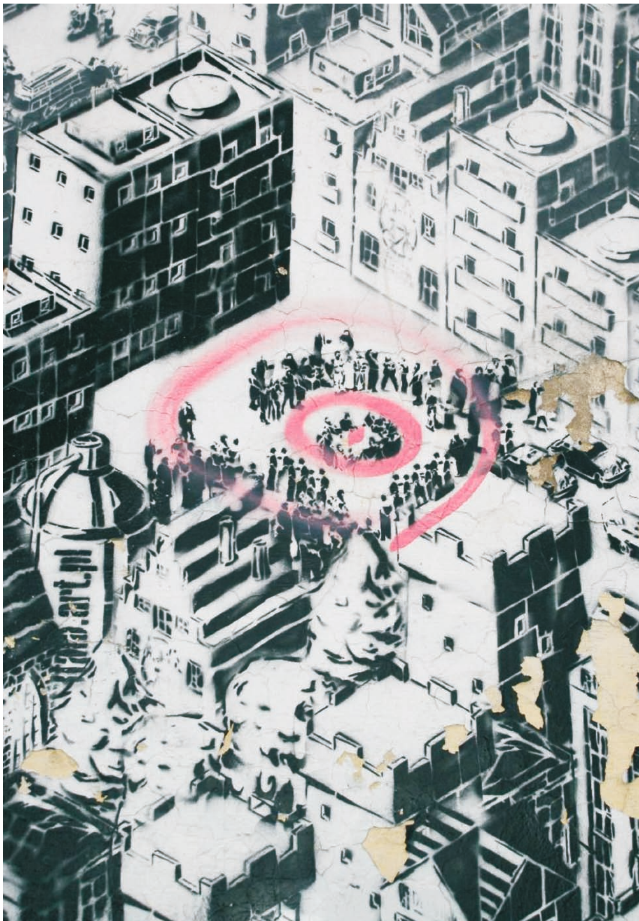
Fig. 15. Mural on the wall of the Brain Club on Gdanska Street