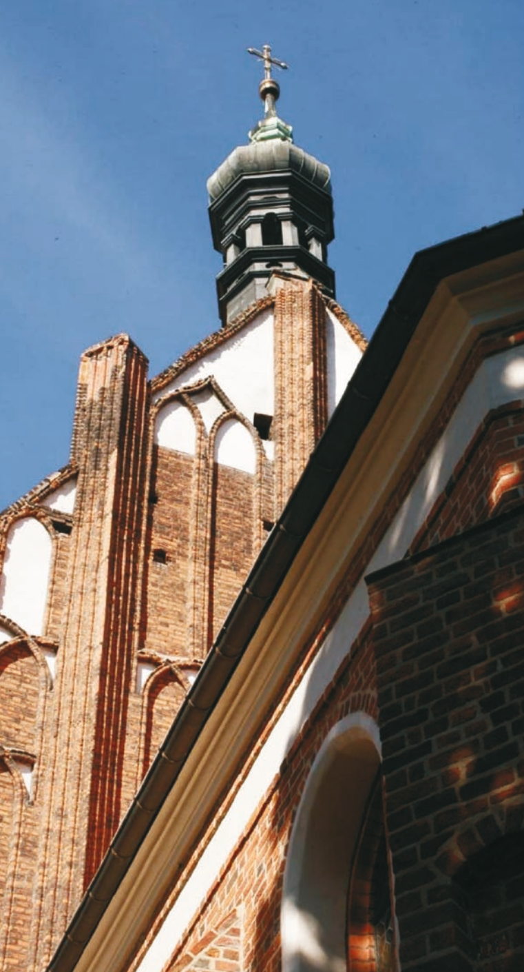
Fig. 11. The Cathedral

also be played for the sake of participating in it. The game is most often intended to lead to the discovery of truth, to an attempt to understand a particular work of art. This phenomenon can proceed on the basis of a dialogue between subject and object. Martin Buber wrote about such a mechanism, where I – the subject, riddles you. In our case, he riddles the architecture. “Every concrete situation, every thought and every event appeals to me, riddles me, demands that I receive this riddling of my You and respond to it, that I enter into a relationship with it.” Into a relationship with the object, which is architecture, and all this can take place with metaphysical participation – He. “According to Buber, man can believe in values only when he