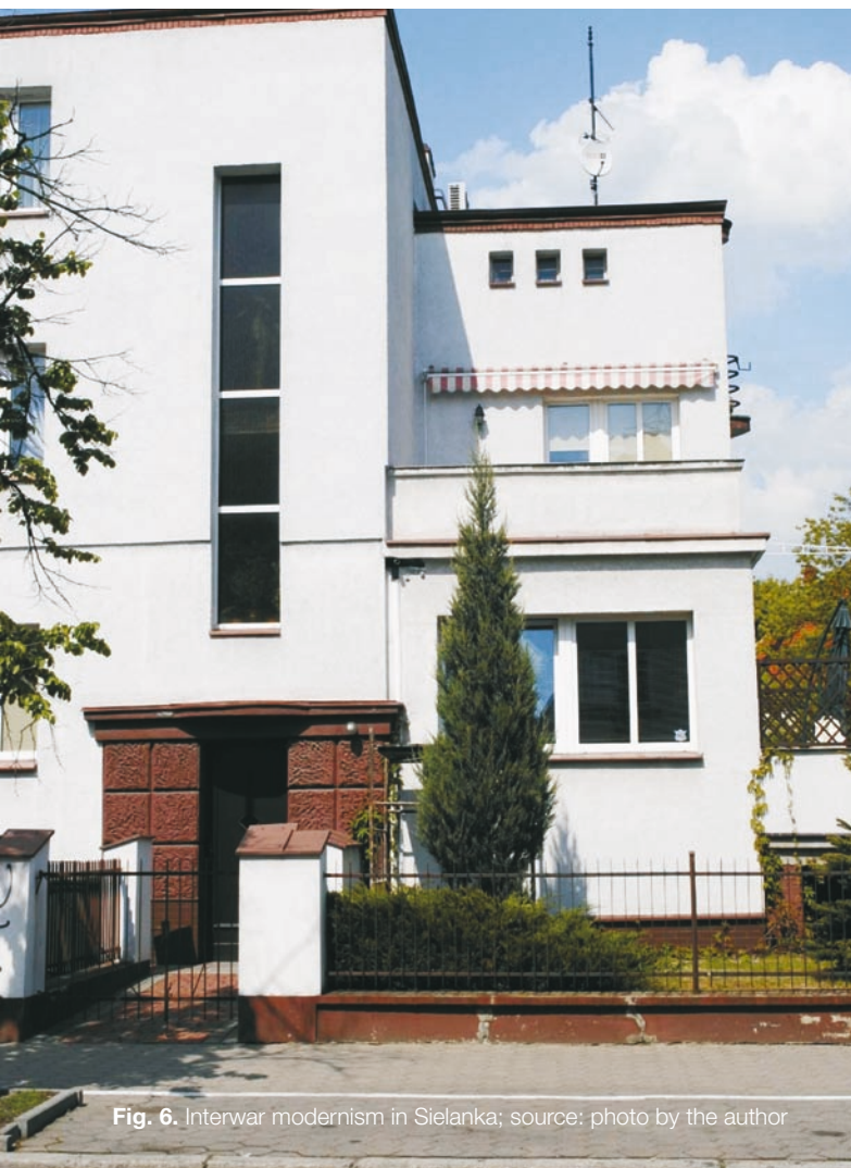
Fig. 6. Interwar modernism in Sielanka; source: photo by the author