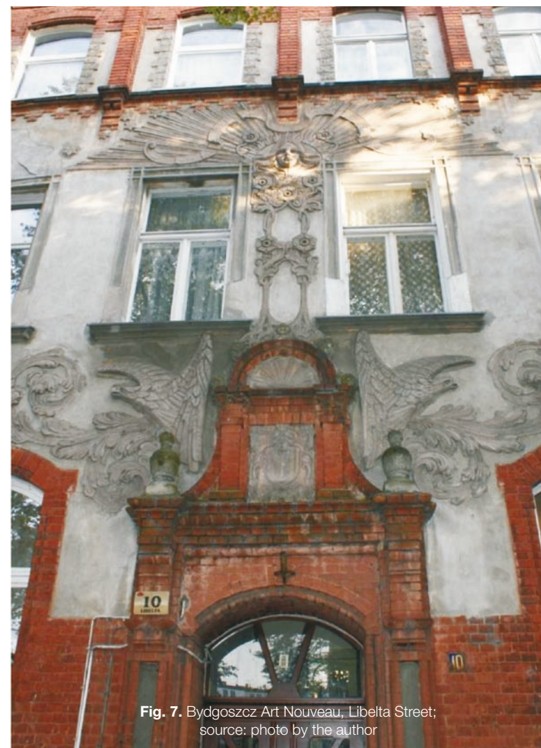
Fig. 7. Bydgoszcz Art Nouveau, Libelta Street