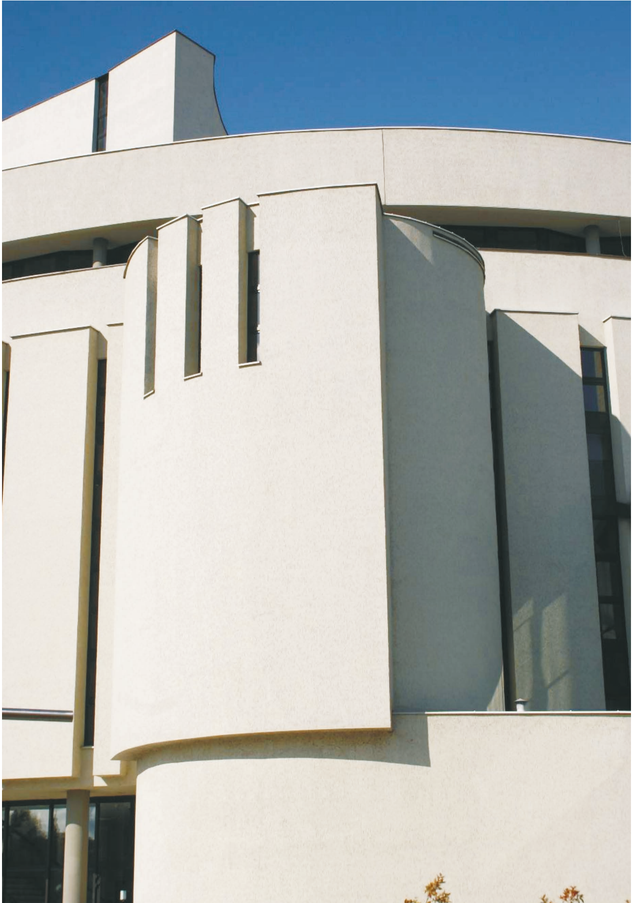
Fig. 12. The Nova Opera House