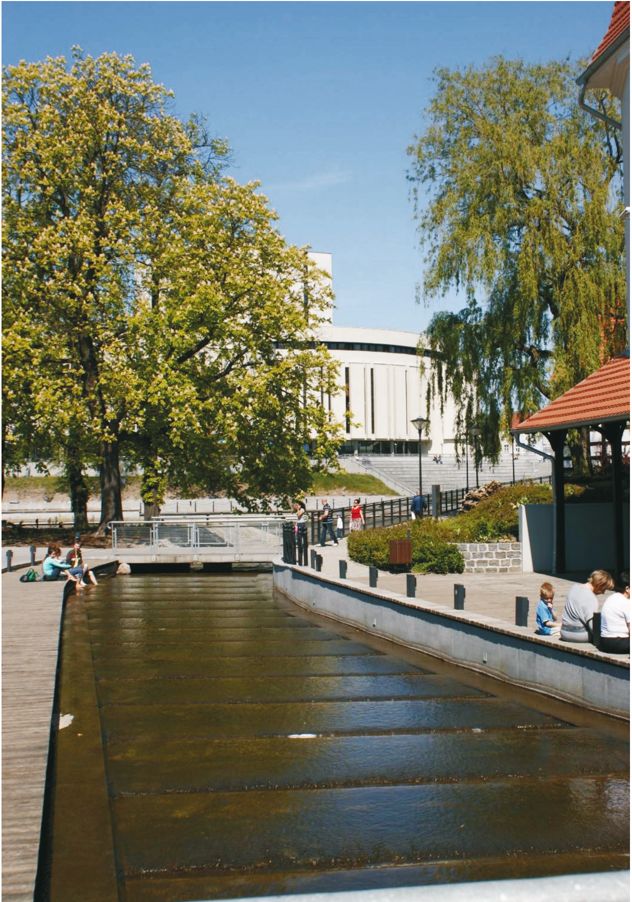
Fig. 13. Międzywodzie overlooking the Opera Nova